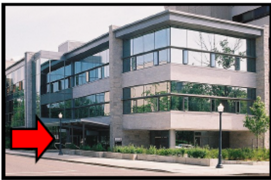
Beamish-Munroe front Door (Division and Union)